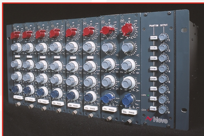
5U rack fitted with two 1073 and six 1084 modules

Based on the same technology as the 1073s, the 1084s also deliver the unique sound and quality of Neve. The 1084s offer additional features including 3 switchable EQ bands with cut and boost, a high Q for presence and low pass/high pass filters.