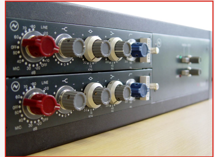
3U Rack fitted with 1073 modules